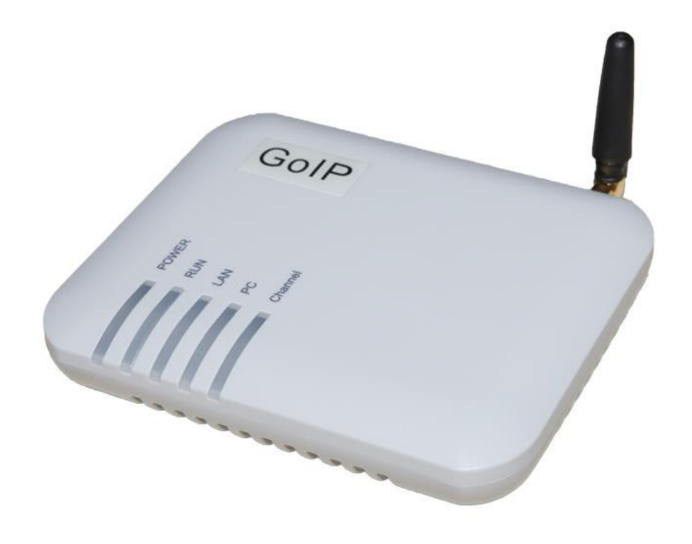
SMS Box for LabCollector Logger Add-on